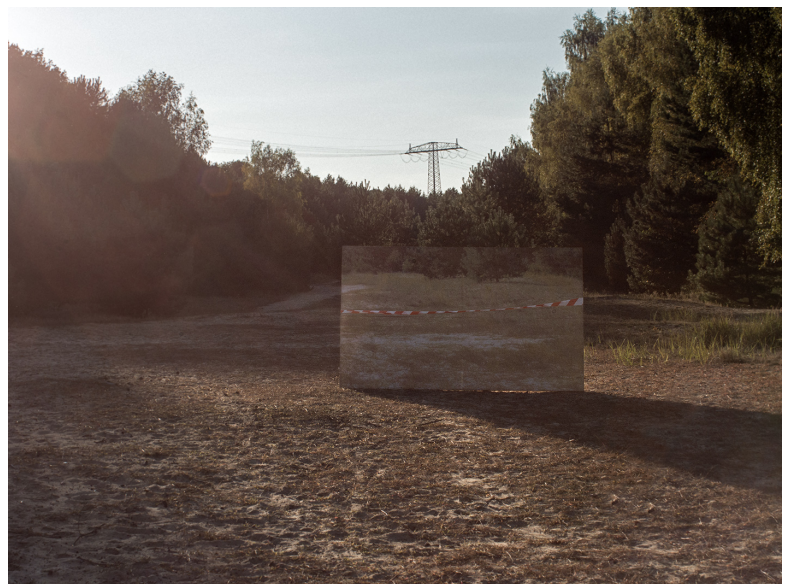
BETTY BÖHM: Reservat, 2017 Fine Art Print on wooden construction, 240 x 180 x 50 cm

The works displayed at CLB are significantly influenced by the omnipresent migration crisis as well as the repression and marginalization of certain ethnic groups and the hence arising psychological echo. Utilizing a multidisciplinary approach (photography, video, installation, sound), Betty Böhm creates empathic settings and intermediate worlds, which elude an obvious interpretation, thus offering the beholder room for personal connotations and experiences.